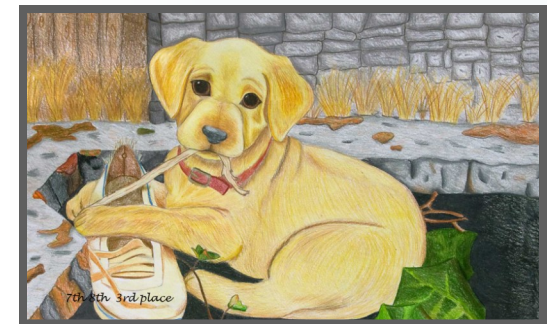
One of our past winners from Skyridge Middle School, Grade 7th/8th.

Dog Fanciers of Oregon & Tualatin Kennel Club.